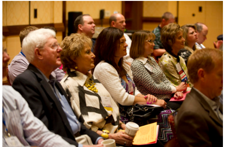
The 2011 TLTA Annual Conference & Business Meeting in San Antonio provided over 350 attendees with continuing education