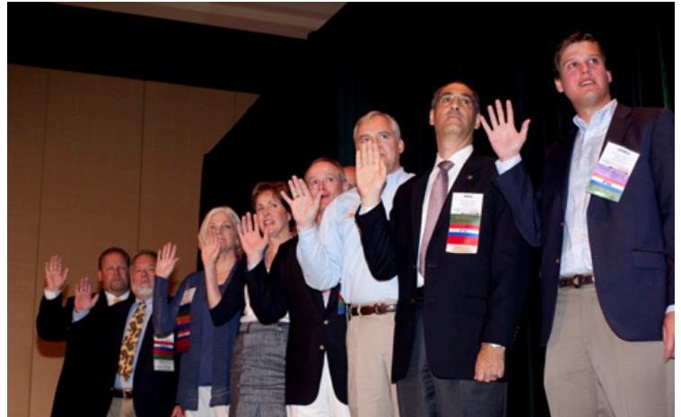
The 2011-2012 TLTA Board of Directors were installed at the 2011 Annual Conference & Business Meeting